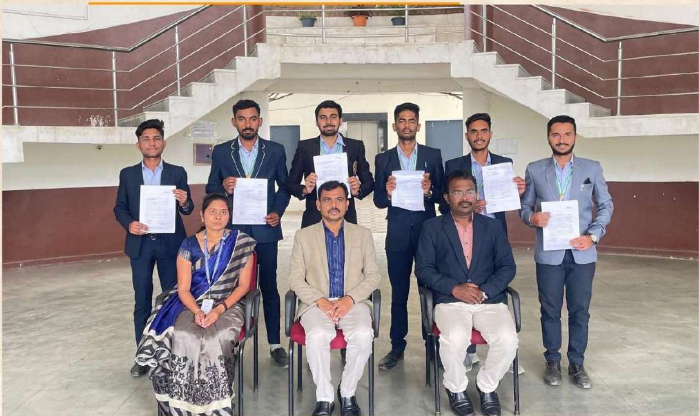
Students selected in the AY 2023-2024