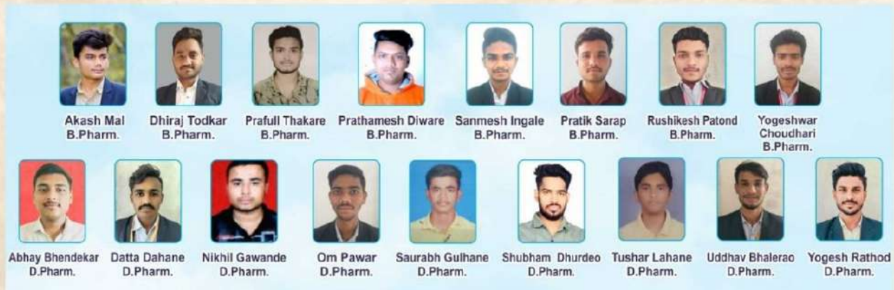
Students selected in the AY 2022-2023